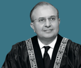
JUSTICE (R.) SYED MANSOOR ALI SHAH